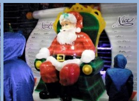
Ice sculpture of Santa