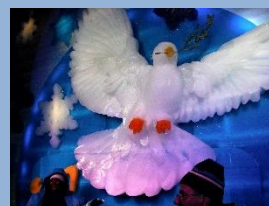
Ice sculpture of Peace Dove.....Crystal clear ice