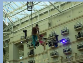
More Acrobats.....foot balancing act