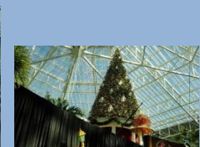
Tree at Emerald Plaza